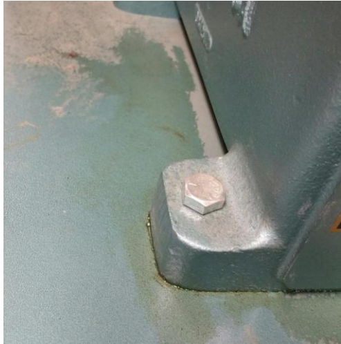
FIGURE 3 – NORMAL OIL ON BRACKET