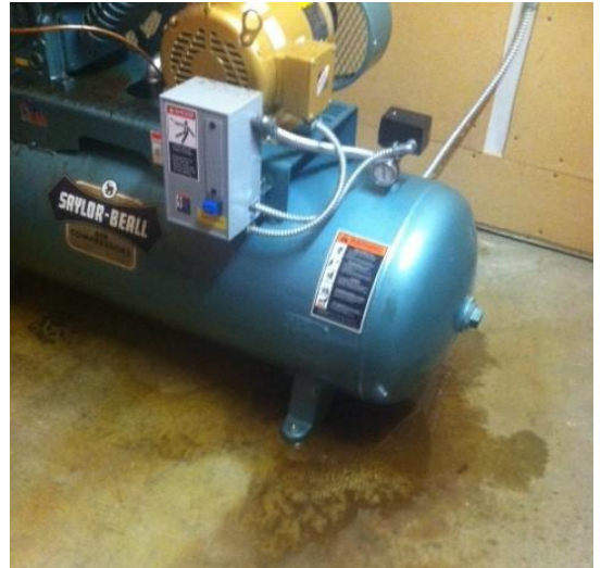
FIGURE 1 – NORMAL OIL DISCHARGE ON FLOOR

1. NORMAL OIL DISCHARGE – It is normal and expected that a small amount of oil will travel past the piston rings of the piston-type air pumps used on NITROGEN-PAC™ CTAs. This even happens in an automobile engine, where the oil is burned along with the gasoline.