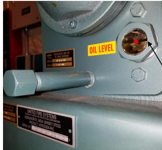
NORMAL OIL LEVEL